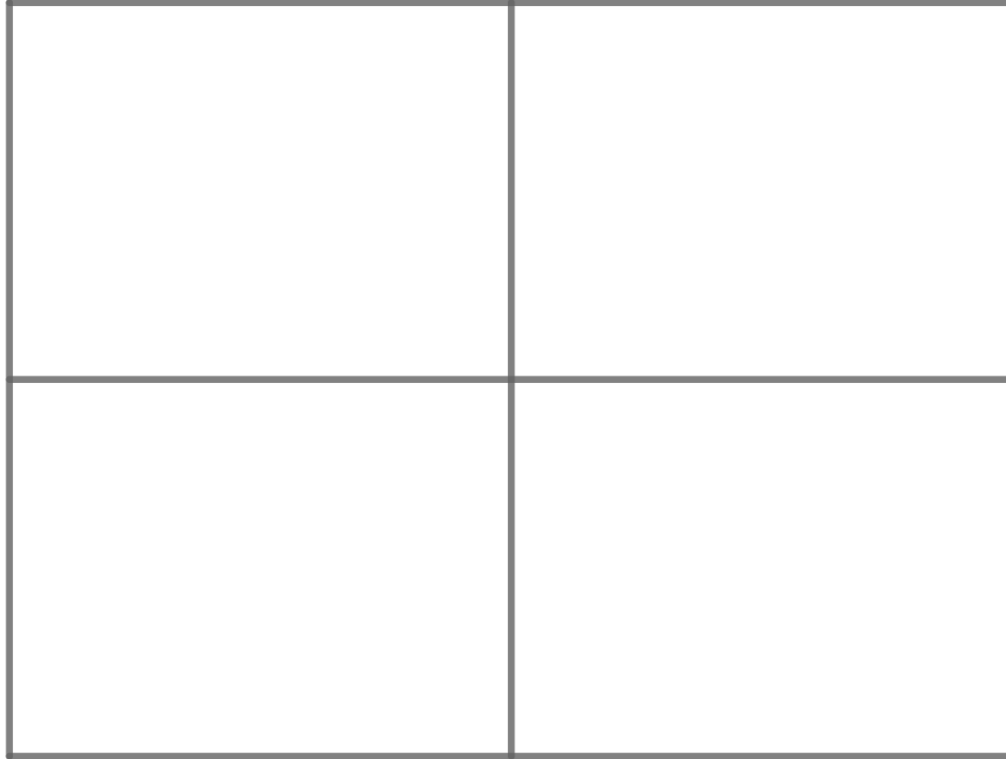
Figure 2: 2021 AMC 10A (Nov) Problem 18

and the farmer does not want to grow soybeans and potatoes in any two sections that share a border. Given these restrictions, in how many ways can the farmer choose crops to plant in each of the four sections of the field?